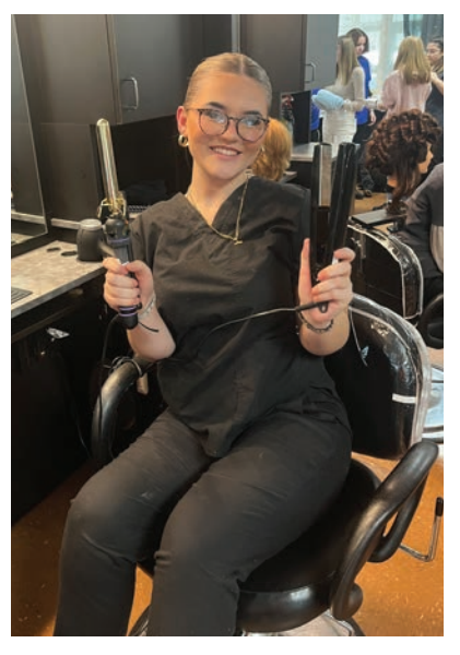
Shout Out to Wildcats! Our Positive Behavioral and Intervention Supports (PBIS) is at work recognizing all school members, even the adults, for behaviors that exemplify what it means to be a Wildcat!