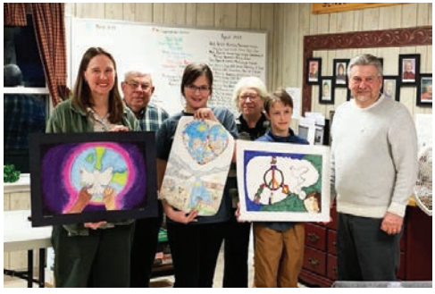
Lions Club members present the winners of this year's Peace Poster Contest

The Public Budget Hearing will be held in the Schroon Lake Central School Auditorium at 1125 US Rt. 9 Schroon Lake, N.Y. 12870.