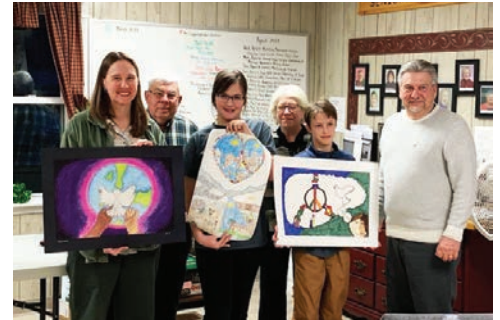
Lions Club members present the winners of this year's Peace Poster Contest

The Public Budget Hearing will be held in the Schroon Lake Central School Auditorium at 1125 US Rt. 9 Schroon Lake, N.Y. 12870.